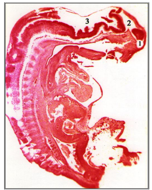
Fig. 1. Sagittal section of embryo 6,0 mm TKD, Stained with hematoxylin and eosin. Specimens. Ob. 4,0 Ok. 5,0. 1 – anterior cerebral vesicle; 2 – middle cerebral vesicle; 3 – posterior cerebral vesicle.

form the front and lower horns, which are located in the frontal and temporal lobes.